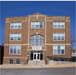
Fox Park 2617 Shenandoah Ave. St. Louis, MO 63104

Momentum Academy is a public charter school district that is committed to serving families in the City of St. Louis. Momentum Academy is managed by the Momentum Board of Directors, an independent group of community members who are committed to the mission and vision of Momentum schools. Our charter is held by the Missouri Charter Public School Commission. Momentum Academy has four locations in south St. Louis City: Tower Grove South, Fox Park, Tower Grove East and Gravois Park. The central office is located in the Soulard neighborhood. Momentum Academy has over 150 staff members committed to serve over 750 Pre-K through 8th grade scholars each year.