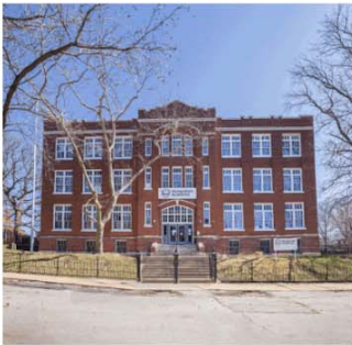
Gravois Park 3630 Ohio Ave. St. Louis, MO 63118