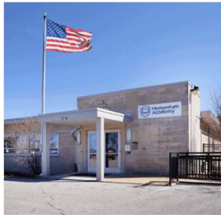
Tower Grove South 3716 Morganford Road St. Louis, MO 63116