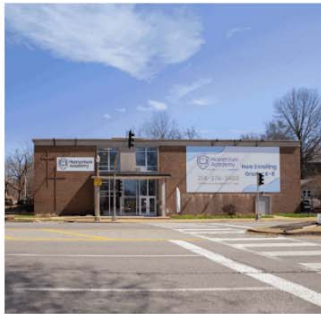
Tower Grove East 2900 S. Grand Blvd. St. Louis, MO 63118